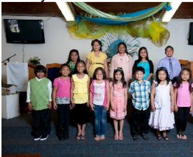
Valley Faith Unity Kids Praise Team

Location: Sunnyvale First UMC, 535 Old San Francisco Road, Sunnyvale, CA